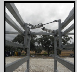
Pneumatic configurations (optional)