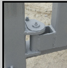
Heavy Duty Greasable Urethane Hinges