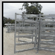
Head Access Gates