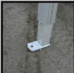
Hot Dipped Galvanized Legs