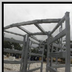
Latchable 2 position Head Access Gates