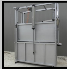
Pneumatic Exit Door