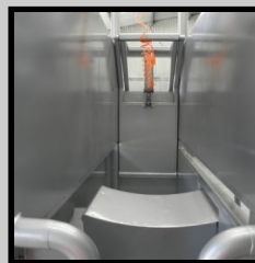
Under body Support System