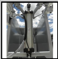
Neck Extender Function